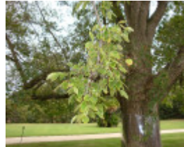
T11243 Ulmus minor 'Variegata'