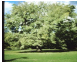
T11243 Ulmus minor 'Variegata'