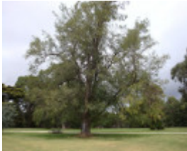
T11243 Ulmus minor 'Variegata'