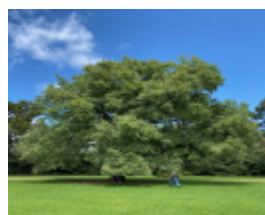
Werribee Park trees - 84