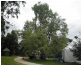
T11243 Ulmus minor 'Variegata'