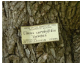
T11243 Ulmus minor 'Variegata'