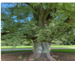
Werribee Park trees - 86