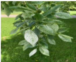
Werribee Park trees - 89