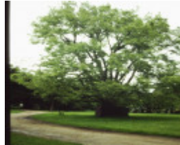
T11243 Ulmus minor 'Variegata'