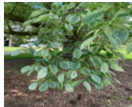
Werribee Park trees - 90