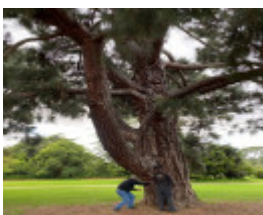
Werribee Park trees - 39