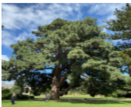
Werribee Park trees - 42