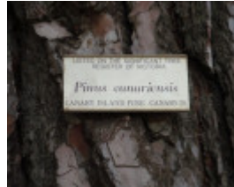
T11244 Pinus canariensis