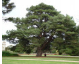
T11244 Pinus canariensis