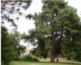
T11244 Pinus canariensis