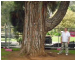
T11244 Pinus canariensis