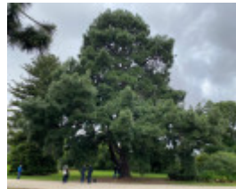
Werribee Park trees - 40