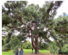
Werribee Park trees - 38