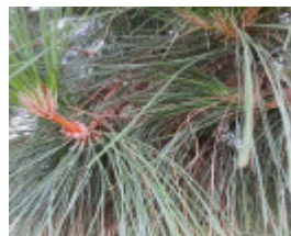
Werribee Park trees - 37