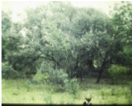
T11270 Eucalyptus polyanthemos