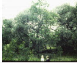
T11270 Eucalyptus polyanthemos