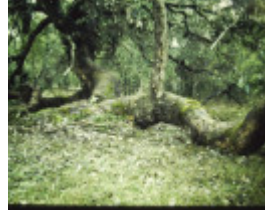
T11270 Eucalyptus polyanthemos