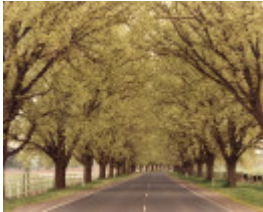
T11281 Avenue of Honour