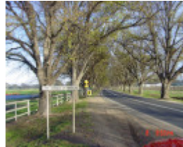
T11281 Ulmus x hollandica