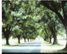
T11281 Ulmus x hollandica