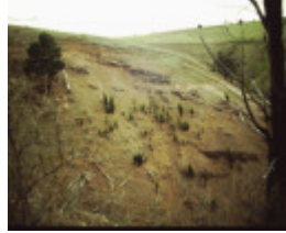
T11286 Callitris glaucophylla