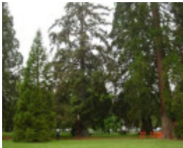
T11296 Picea sitchensis