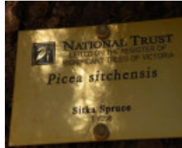
T11296 Picea sitchensis