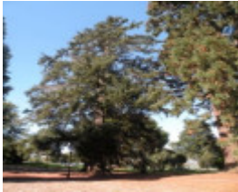
T11296 Picea sitchensis