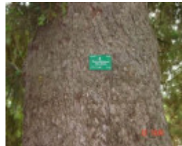
T11296 Picea sitchensis Sitka spruce Bark 2 Ballarat.jpg