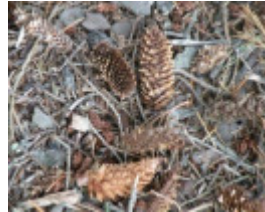
T11296 Picea sitchensis