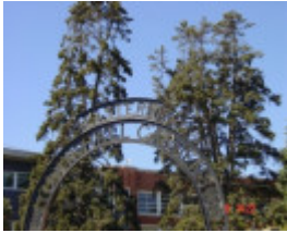
T11307 Cedrus atlantica f. glauca