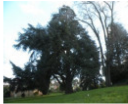
T11307 Cedrus atlantica f. glauca