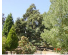
T11307 Cedrus atlantica f. glauca