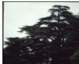
T11307 Cedrus atlantica f. glauca