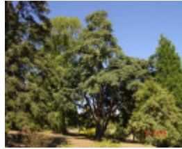
T11307 Cedrus atlantica f. glauca