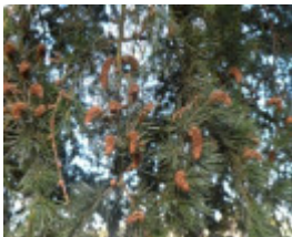
T11307 Cedrus atlantica f. glauca