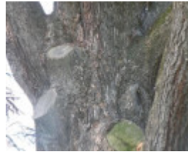
T11307 Cedrus atlantica f. glauca