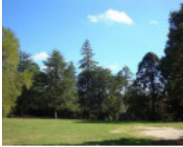
T11340 Sequoia sempervirens