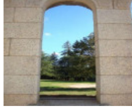
T11340 Sequoia sempervirens