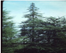
T11340 Sequoia sempervirens