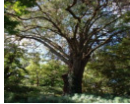
T11346 Eucalyptus sideroxylon