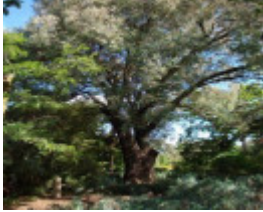
T11346 Eucalyptus sideroxylon