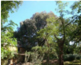
T11346 Eucalyptus sideroxylon