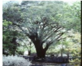
T11346 Eucalyptus sideroxylon