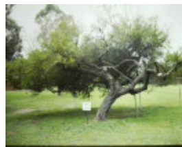
T11374 Acacia karoo