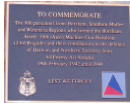
T11374 Acacia karoo