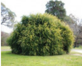
T11374 Acacia karoo