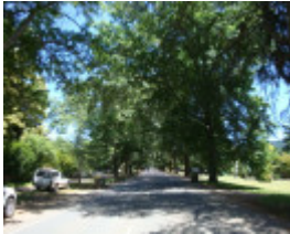
T11402 Quercus palustris et alia