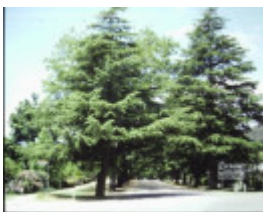
T11402 Quercus palustris et alia