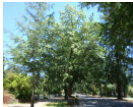
T11402 Quercus palustris et alia