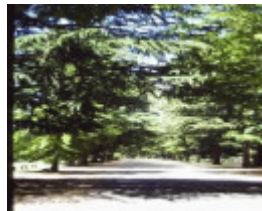
T11402 Quercus palustris et alia