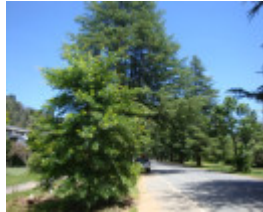
T11402 Quercus palustris et alia