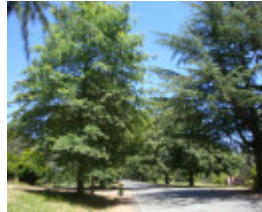
T11402 Quercus palustris et alia