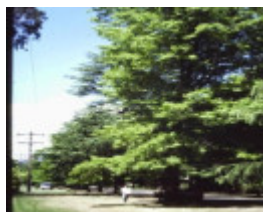
T11402 Quercus palustris et alia