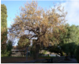
T11418 English Oak