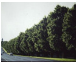
T11449 Ulmus procera