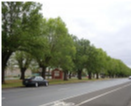
T11449 Ulmus procera