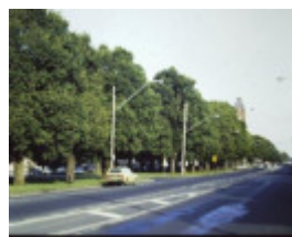
T11449 Ulmus procera