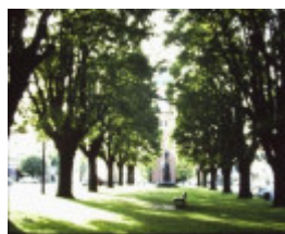
T11449 Ulmus procera