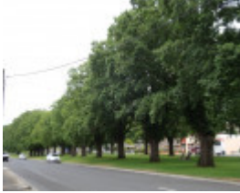
T11449 Ulmus procera