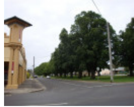
T11449 Ulmus procera