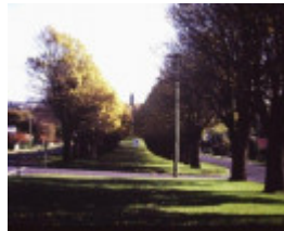
T11449 Ulmus procera