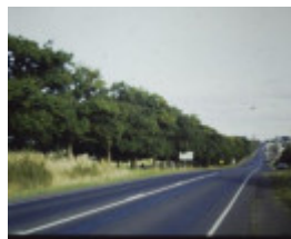
T11449 Ulmus procera