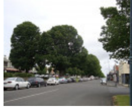
T11449 Ulmus procera