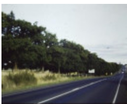
T11449 Ulmus procera