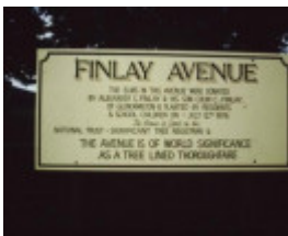
T11449 Ulmus procera