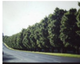
T11449 Ulmus procera