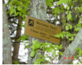
T11457 Ulmus minor 'sarniensis'