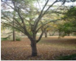
T11457 Ulmus minor 'sarniensis'