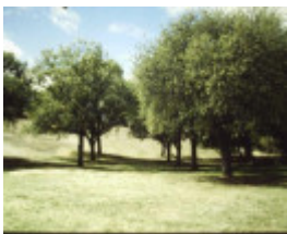
T11471 Quercus macrolepis