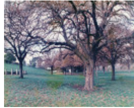
T11471 Quercus macrolepis