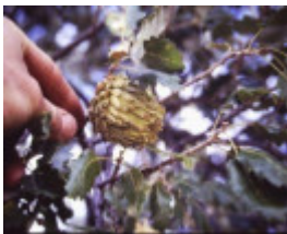
T11471 Quercus macrolepis