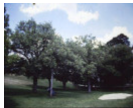
T11471 Quercus macrolepis