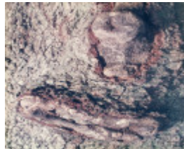
T11471 Quercus macrolepis Trunk