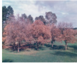
T11471 Quercus macrolepis