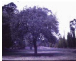
T11471 Quercus macrolepis