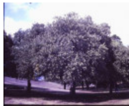
T11471 Quercus macrolepis