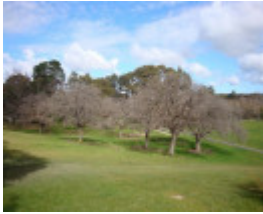
T11471 Quercus macrolepis