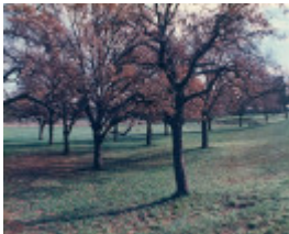
T11471 Quercus macrolepis