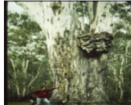
T11488 Eucalyptus camaldulensis