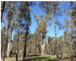
Cohuna Gunbower Island September 2013 007.jpg