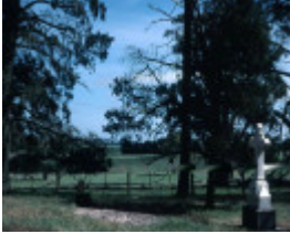
T11511 Pinus radiata