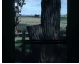
T11511 Pinus radiata Smeaton House Private Cemetery