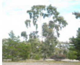
T11541 Corymbia maculata