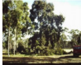
T11541 Corymbia maculata