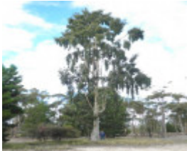
T11541 Corymbia maculata