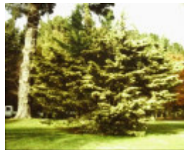
T11570 Hesperocyparis macrocarpa hodginsii