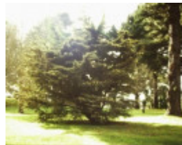
T11570 Hesperocyparis macrocarpa hodginsii