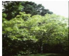
T11571 Catalpa bignonioides purpurea