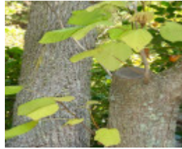
T11571 Catalpa bignonioides purpurea