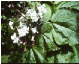
T11571 Catalpa bignonioides purpurea flower