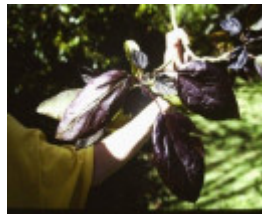
T11571 Catalpa bignonioides purpurea