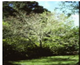
T11571 Catalpa bignonioides purpurea