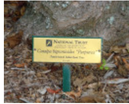
T11571 Catalpa bignonioides purpurea