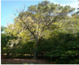
T11571 Catalpa bignonioides purpurea