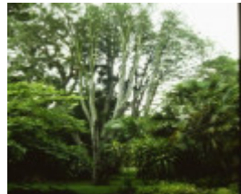
T11594 Prumnopitys andina