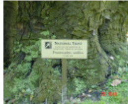
T11594 Prumnopitys andina