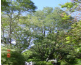
T11594 Prumnopitys andina