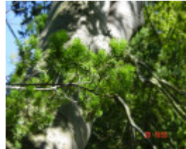
T11594 Prumnopitys andina