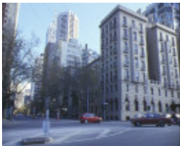
1 alcaston house collins street melbourne side view