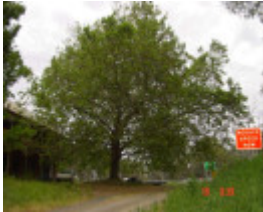
T11684 Platanus x acerifolia