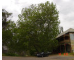
T11684 Platanus x acerifolia