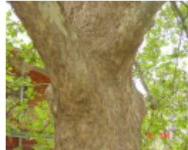
T11684 Platanus x acerifolia