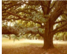
T11722 Quercus robur Branches