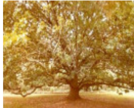
T11722 English Oak