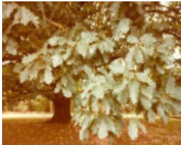
T11722 Quercus robur Foliage