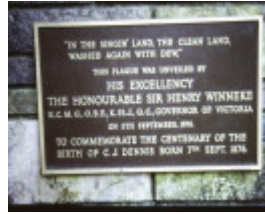
T11733 Fagus sylvatica f. purpurea