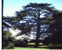
T11758 Cedrus deodara