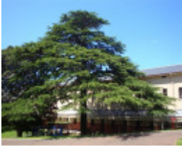
T11758 Cedrus deodara