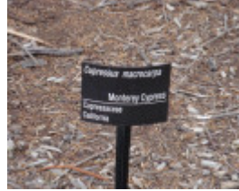
T11848 Cupressus macrocarpa