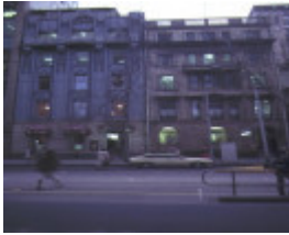
1 victor horsley chambers collins street melbourne front view