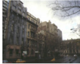
victor horsley chambers collins street melbourne top end collins street