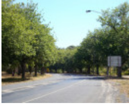
T12001 Quercus robur