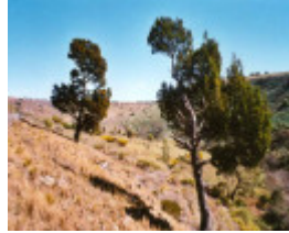
T12041 Callitris glaucophylla