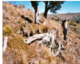
T12041 Callitris glaucophylla stump