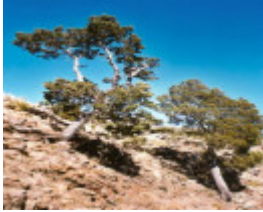
T12041 Callitris glaucophylla