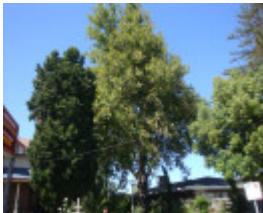
T12049 Platanus X acerifolia