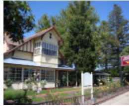
T12049 Platanus X acerifolia