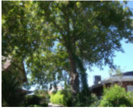
T12049 Platanus X acerifolia