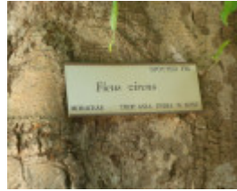
T12051 Ficus virens