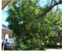
T12051 Ficus virens