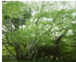
T12051 Ficus virens