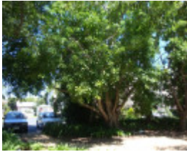
T12051 Ficus virens