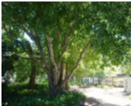
T12051 Ficus virens