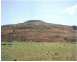
L10280 Parwan Valley