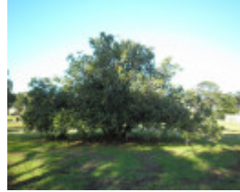
T12097 Ficus carica subspecies carica