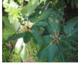
T12097 Ficus carica subspecies carica