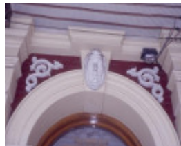
h00116 old colonists hall lydiard street north ballarat death mask over front entrance she project 2004