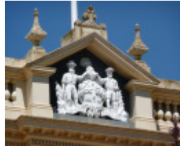
OLD COLONISTS ASSOCIATION SOHE 2008