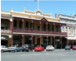
OLD COLONISTS ASSOCIATION SOHE 2008