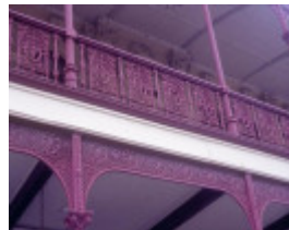
h00116 old colonists hall lydiard street north ballarat iron lace work she project 2004