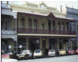
h00116 old colonists club association ballarat front view