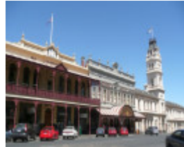
OLD COLONISTS ASSOCIATION SOHE 2008