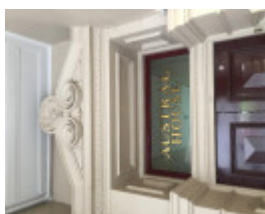
AUSTRAL BUILDINGS Nov 2016