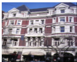
1 austral building collins street melbourne front view