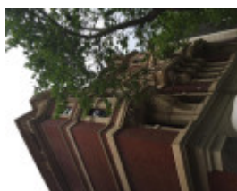
AUSTRAL BUILDINGS Nov 2016