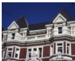
austral building collins street melbourne detail external top floor