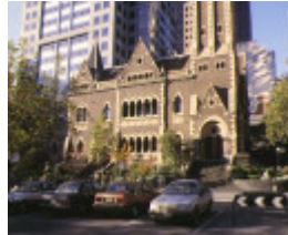
independent church of melbourne side detail apr1998