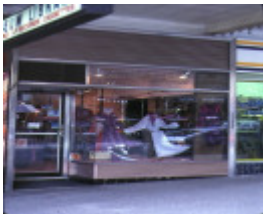
the athenaeum building collins street melbourne shop front oct1982