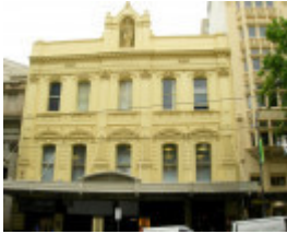
THE ATHENAEUM BUILDING SOHE 2008