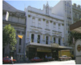
1 the athenaeum building collins street melbourne street view feb1986