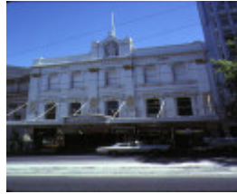
the athenaeum building collins street melbourne front view jan1979