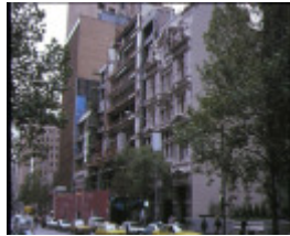
banking chamber commercial bank of australia external view