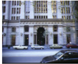
banking chamber commercial bank of australia external entrance