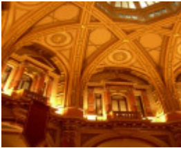
FORMER COMMERCIAL BANK OF AUSTRALIA, BANKING CHAMBER AND ENTRANCE SOHE 2008