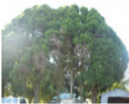
Bhutan Cypress hedge in front of house, 1790 Grand Ridge Rd