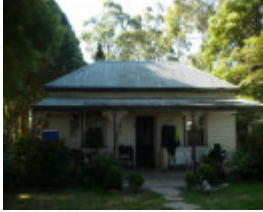
House, 1790 Grand Ridge Rd