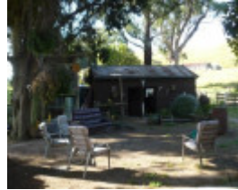
Outbuilding in rear yard of house, 1790 Grand Ridge Rd