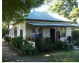
House, 1790 Grand Ridge Rd