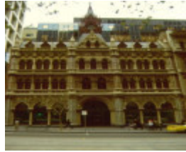
olderfleet h37 july2000