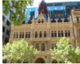
OLDERFLEET BUILDING SOHE 2008