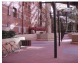
rialto building melb courtyard