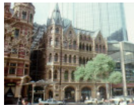
1 rialto collins street h41 may2000