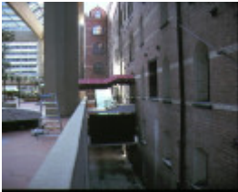
rialto building melb taberet- entrance