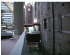
rialto building melb taberet- entrance