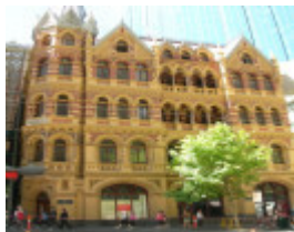
RIALTO BUILDING SOHE 2008