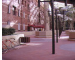
rialto building melb courtyard