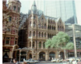
1 rialto collins street h41 may2000