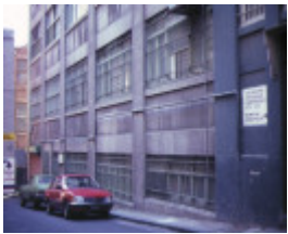
dovers building drewery lane melbourne rear view nov1985