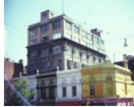
1 dovers building drewery lane lane melbourne front corner view nov1985