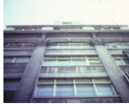
dovers building drewery lane melbourne detail of front windows nov1985