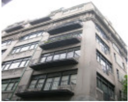
DOVERS BUILDING SOHE 2008