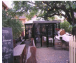
mickveh yisrael synagogue exhibition street melbourne rear view jun1995