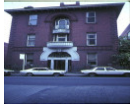
Milton House Flinders Lane Melbourne Front View October 1982