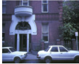
milton house flinders lane melb entrance oct1982