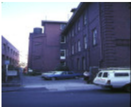
milton house flinders lane melb side view oct1982