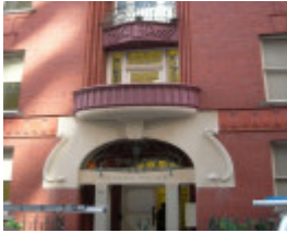
MILTON HOUSE SOHE 2008