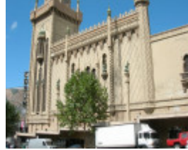
FORUM AND RAPALLO CINEMAS SOHE 2008