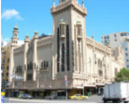
FORUM AND RAPALLO CINEMAS SOHE 2008