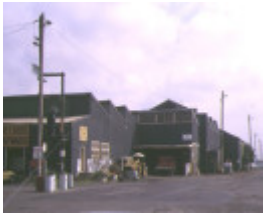
exhibition goods shed spencer street melbourne remnants of number 1 shed