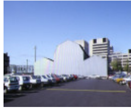
exhibition goods shed spencer street melbourne rear of flinders street extension goods shed