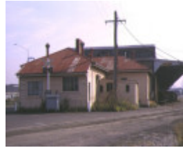
exhibition goods shed spencer street melbourne amenity room number 6 shed mar1989