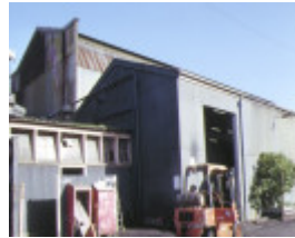
exhibition goods shed spencer street melbourne side view of flinders street extension goods shed