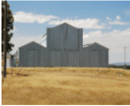
EXHIBITION GOODS SHED SOHE 2008