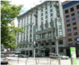
COMMERCIAL TRAVELLERS ASSOCIATION BUILDING SOHE 2008