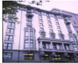
1 commercial travellers association building flinders street melbourne front elevation sep1998