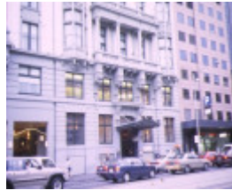
commercial travellers association building flinders street melbourne front entrance view sep1998