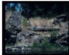
BUCKLEYS FALLS PUMPING STATION