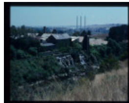
BUCKLEYS FALLS PUMPING STATION