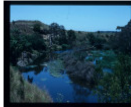
BUCKLEYS FALLS PUMPING STATION