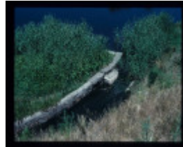
BUCKLEYS FALLS PUMPING STATION