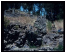
BUCKLEYS FALLS PUMPING STATION