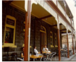
macs hotel franklin street verandah january 2000