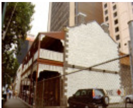
macs hotel franklin street east facade january 2000