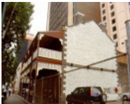
macs hotel franklin street east facade january 2000