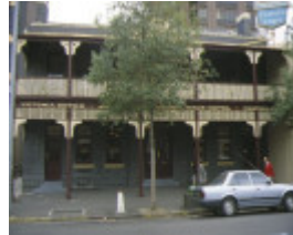
Macs Hotel Franklin Street Melbourne Exterior Front