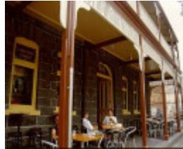
macs hotel franklin street verandah january 2000