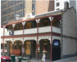
MACS HOTEL SOHE 2008