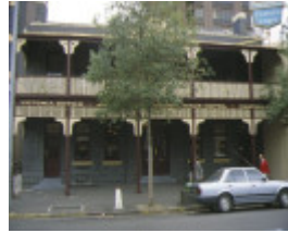
Macs Hotel Franklin Street Melbourne Exterior Front